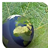
“GREEN” STIMULUS BILL